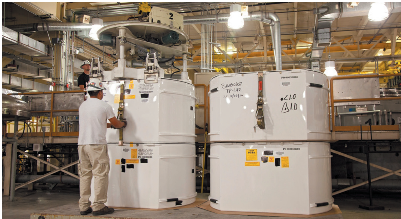
Drums containing contaminated materials from the US nuclear-defence programme are stored at the Waste Isolation Pilot Plant in New Mexico.